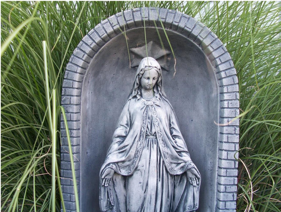
Our Lady Star of the Sea